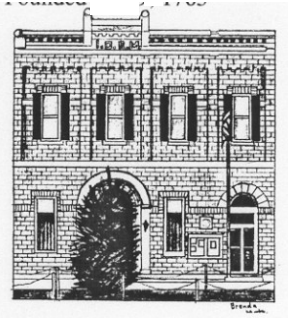
Sharpsburg Town Hall

SHARPSBURG Oldest Town in Washington County Founded July 9, 1763