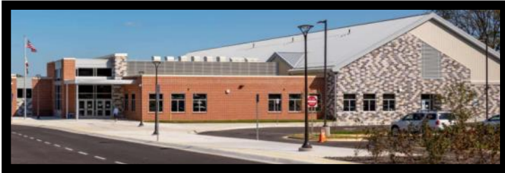
Sharpsburg Elementary School

for Micah's Backpack whose volunteers provide weekend food during the school year. LfC's plan is to provide 30 kids with ten meals per week this summer, a huge goal in this small place!