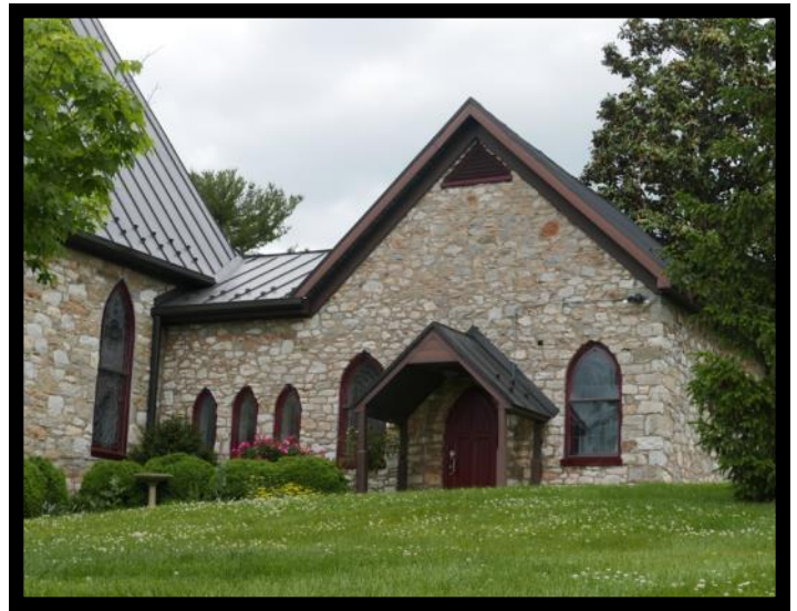
Former St. Paul's Parish House, Currently the Edwards Room

About 1919 the library was moved to the Episcopal Church Parish House ( Currently St. Paul's "Edwards Room" ). On the 1922 Sanborn map of Sharpsburg the library is shown to the right just behind St Paul's Church. It was later moved to the "Smith" property at 131 West Main Street then to the