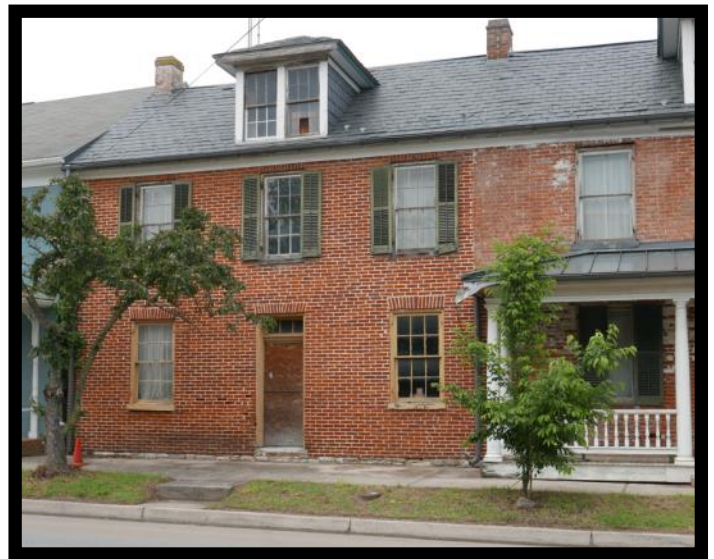
121 East Main Street