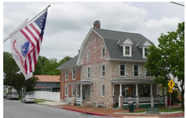
Former Town Hotel

No. 2 Station was maintained by W.J. Highbarger till 1907 when William passed away.