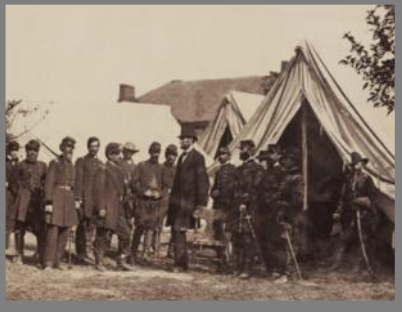
on Friday, October 3, 1862, and depicts a dining chair. According to some,

this is the very chair in the Museum but later repaired with modifications. To most others, the chair was a different Grove Farm dining room chair. Maybe the President sat in it! Maybe he leaned on it heavily, closed his eyes, and contemplated the catastrophe of that war, the dreadful aftermath of that battle, and the burden of leadership in that dark time. You decide.